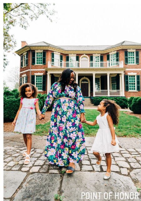
POINT OF HONOR