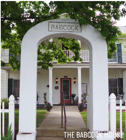
THE BABCOCK HOUSE