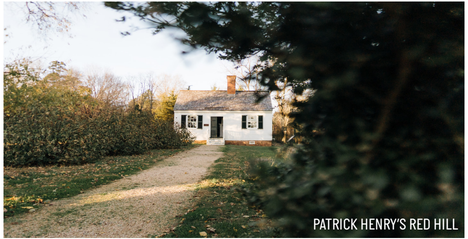
PATRICK HENRY'S RED HILL