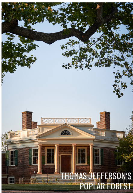
THOMAS JEFFERSON'S POPLAR FOREST