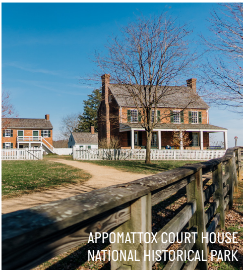
APPOMATTOX COURT HOUSE NATIONAL HISTORICAL PARK