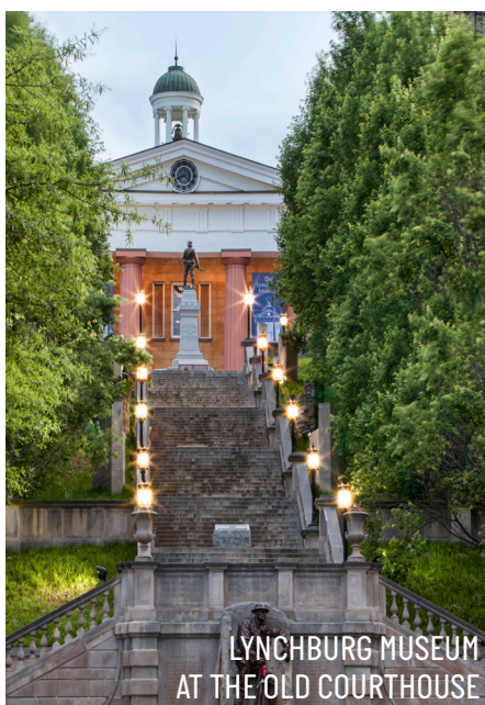
LYNCHBURG MUSEUM AT THE OLD COURTHOUSE