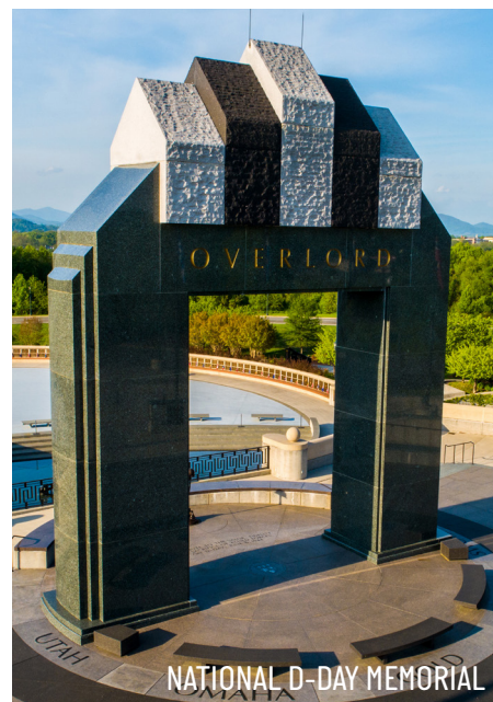
NATIONAL D-DAY MEMORIAL