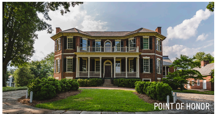
POINT OF HONOR