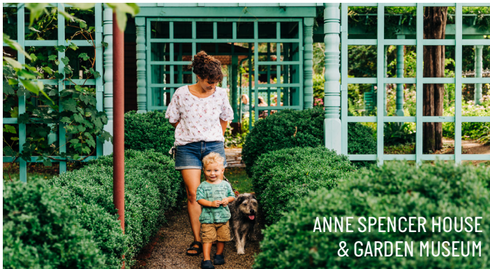
ANNE SPENCER HOUSE & GARDEN MUSEUM