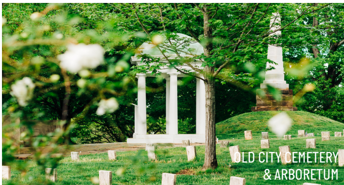
OLD CITY CEMETERY & ARBORETUM