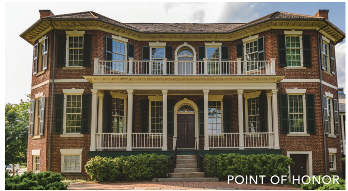
POINT OF HONOR