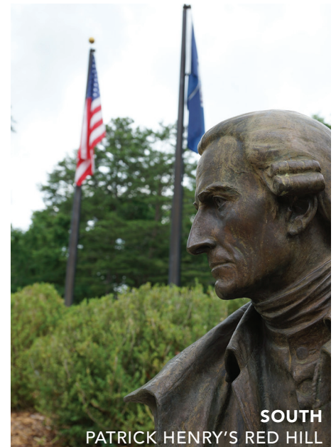
SOUTH PATRICK HENRY'S RED HILL