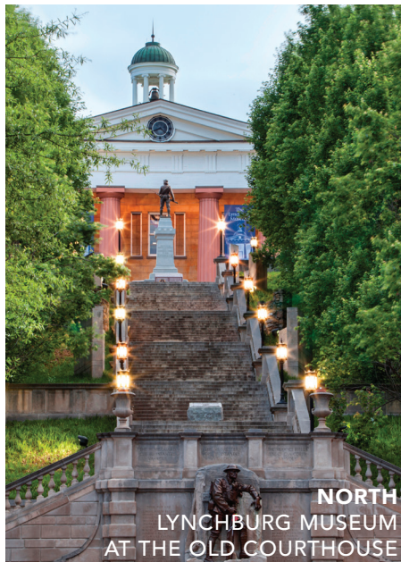
NORTH LYNCHBURG MUSEUM AT THE OLD COURTHOUSE