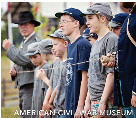
AMERICAN CIVIL WAR MUSEUM