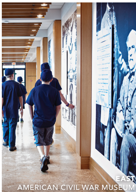
EAST AMERICAN CIVIL WAR MUSEUM