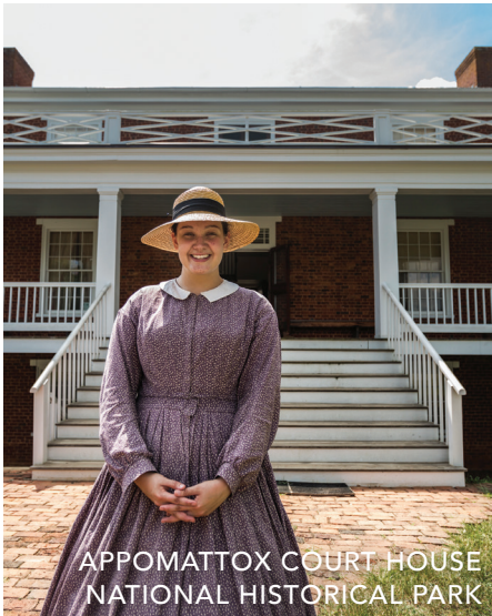
APPOMATTOX COURT HOUSE NATIONAL HISTORICAL PARK