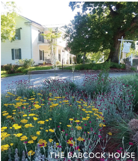
THE BABCOCK HOUSE

The Babcock House is a restored, turn of the century inn, dating back to 1884. You will truly feel you have taken a step back in time as you dine here for lunch.