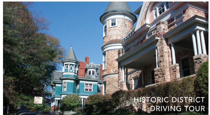
HISTORIC DISTRICT DRIVING TOUR