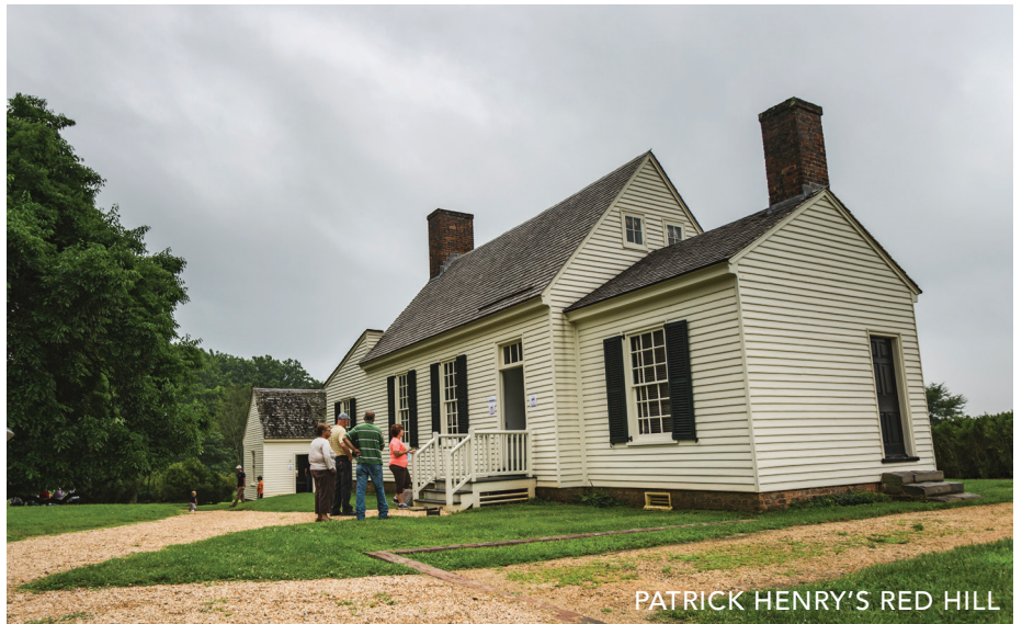
PATRICK HENRY'S RED HILL