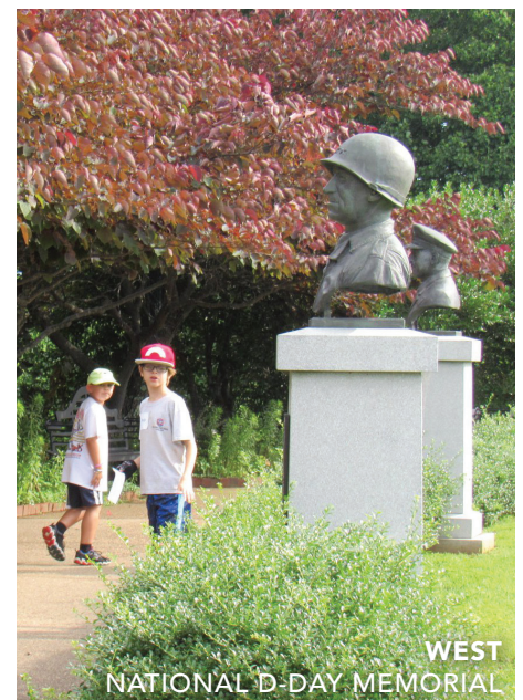
WEST NATIONAL D-DAY MEMORIAL