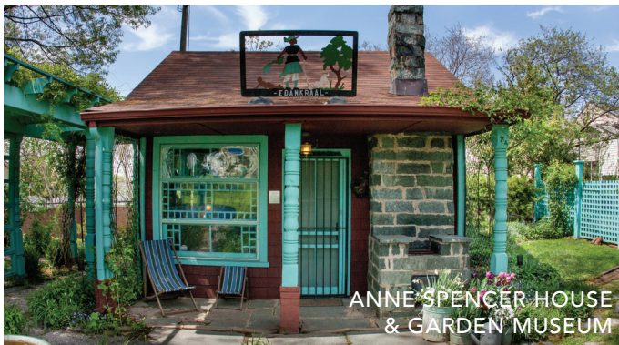
ANNE SPENCER HOUSE & GARDEN MUSEUM