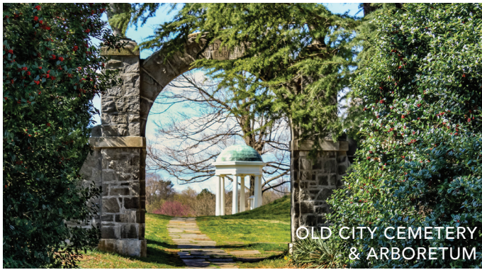
OLD CITY CEMETERY & ARBORETUM