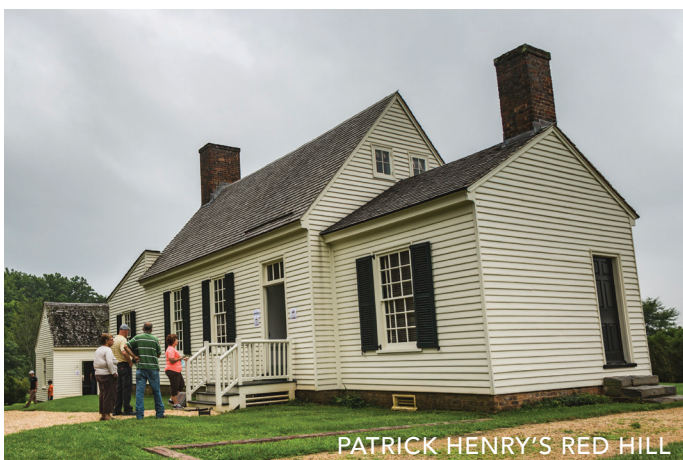
PATRICK HENRY'S RED HILL

Red Hill is the last home and the burial place of American patriot Patrick Henry. He is best known for his five terms as governor of Virginia and his "Give Me Liberty or Give Me Death" speech to the Virginia Convention in 1775.