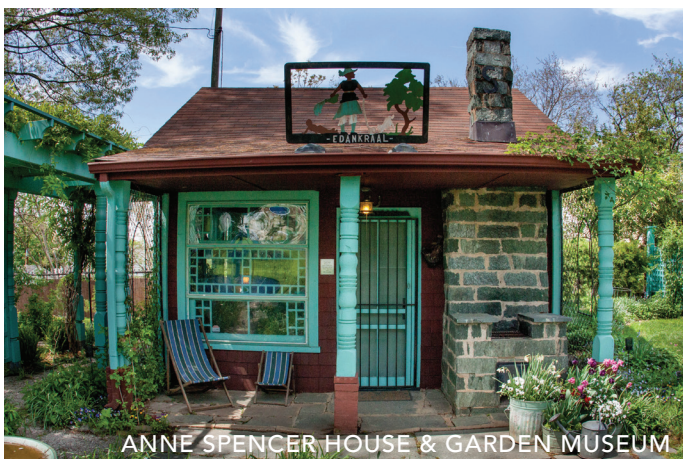
ANNE SPENCER HOUSE & GARDEN MUSEUM

Poplar Forest is Thomas Jefferson's secluded retreat, now a National Historic Landmark. A mature and innovative architectural masterpiece, Jefferson designed the octagonal house during his second term as President of the United States. Jefferson sojourned to Poplar Forest between the ages of 66-80 to rekindle his creativity, spend time with his grandchildren and escape the crowds at Monticello.